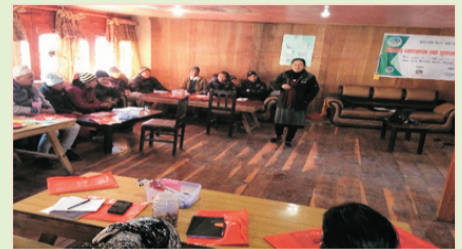
Governance and Management Training

To enhance successful and strong leadership, governance and management skills for head teachers, SMCs and PTAs, Governance and management training for four days was organised recently in Salleri benefitting 20 males and 4 females started from 26th Dec-29th Dec, 2017. Participants enhanced their capacities to effectively monitor teaching and learning activities in their schools.